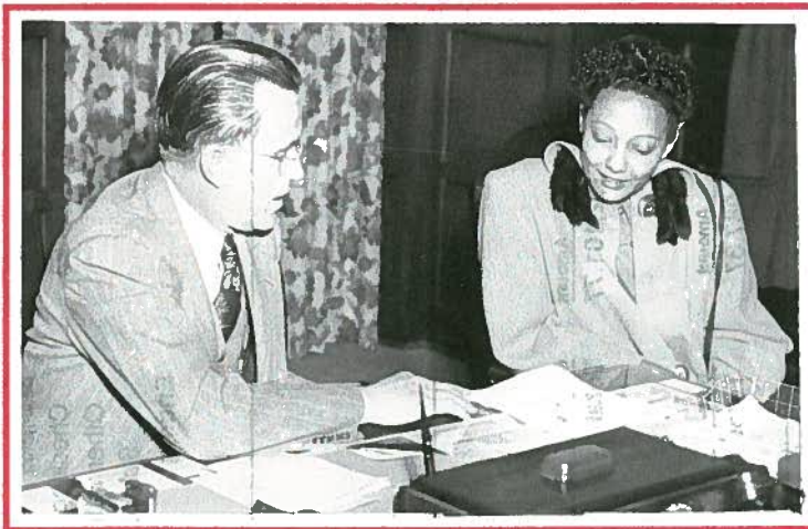
— The Tulsa World