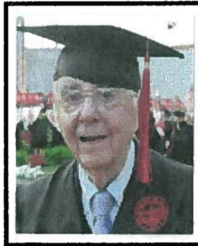
— Sooner magazine

Thirty-four of the 100 already have chosen Norman as their destination.