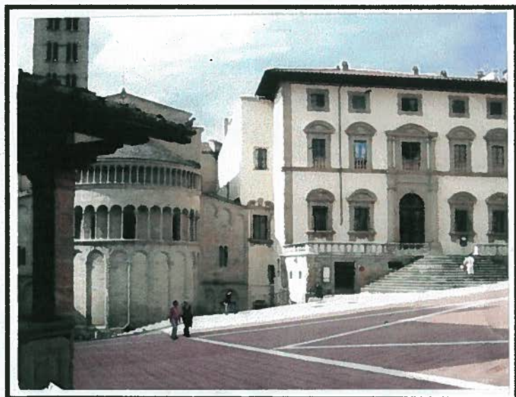
OU'S NEWEST VENUE — Santa Chiara, an 18th-century monastery is being renovated to become the fourth campus of the University of Oklahoma at Arezzo, Italy.

Just five years ago, Hester Hall was renovated in anticipation of housing International Studies. Interest in the program has been so great that further work on the building was deemed necessary.